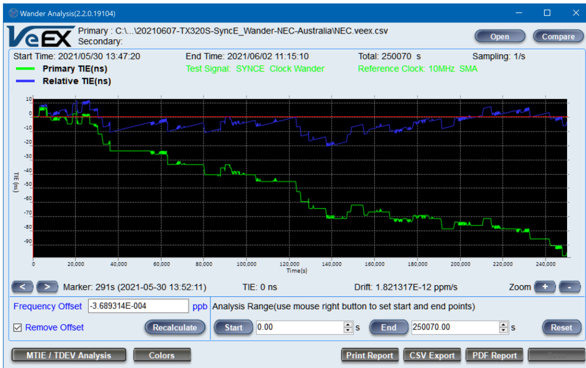
Figure 1: TIE/TE view with basic offset calculations

To obtain a copy of VeEX Wander Analysis PC software (499-04-139), please login to www.veexinc.com (registration not required) and search for "Wander Analysis" or contact us at customercare@veexinc.com